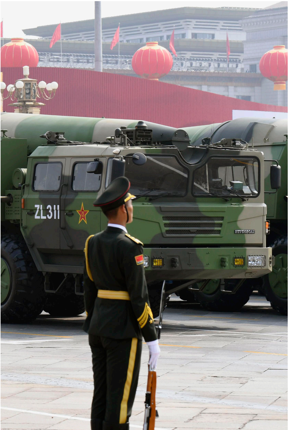
The Chinese Dongfeng ["East Wind"] 41, a nuclear-capable intercontinental ballistic missile, on display during a military parade in Beijing on October 1, 2019.