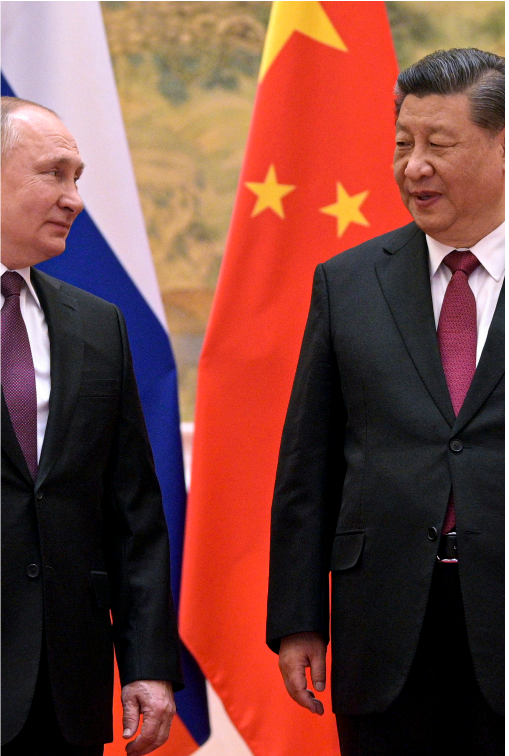
Chinese President Xi Jinping and Russian President Vladimir Putin at their summit meeting in Beijing on February 4, 2022.