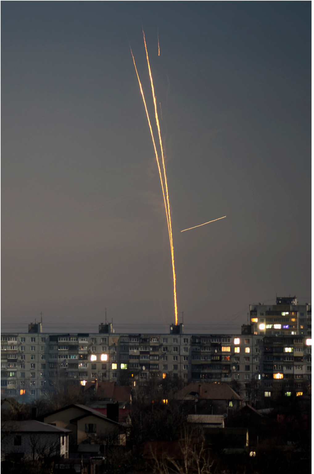
Russian rockets launched against Ukraine as seen at dawn in Kharkiv, Ukraine, on Feb. 8, 2023.