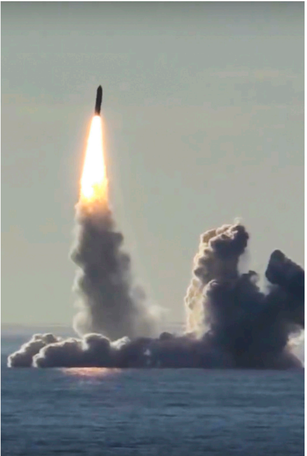
A Russian Bulava ["Mace"] submarine-launched ballistic missile is test-fired on May 24, 2018.