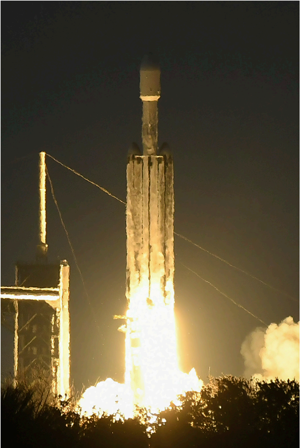
A SpaceX Falcon Heavy rocket launches military payloads for the US Space Force from Cape Canaveral in January 2023.