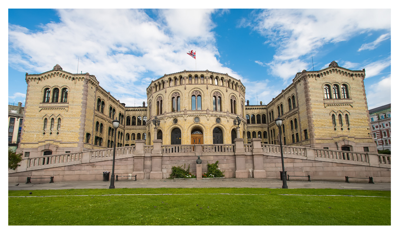
Storting – Norwegian Parliament Building in Oslo, Norway.

North policy. In its assessment of the white paper, it stated at the outset that Norway's interests in the Arctic should be promoted through a strong North Norway. It also emphasized that the best foundation for promoting Norwegian interests in the High North is viable and positive economic development for people in the north.