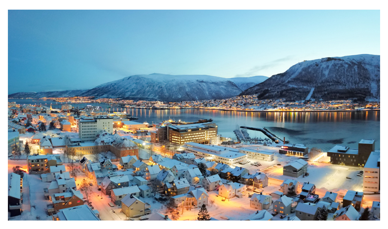
Tromsø, Norway – 660 miles north of the Arctic Circle.

Also, Norway's High North neighborhood is more crowded than that of North America. Russia, Finland, and Sweden are to the east of Norway, and Greenland, Iceland, and the Faroe Islands are to the west. In the Central Arctic Ocean, Norway is one of five coastal states along with Russia, the US, Canada, and Denmark/Greenland. International