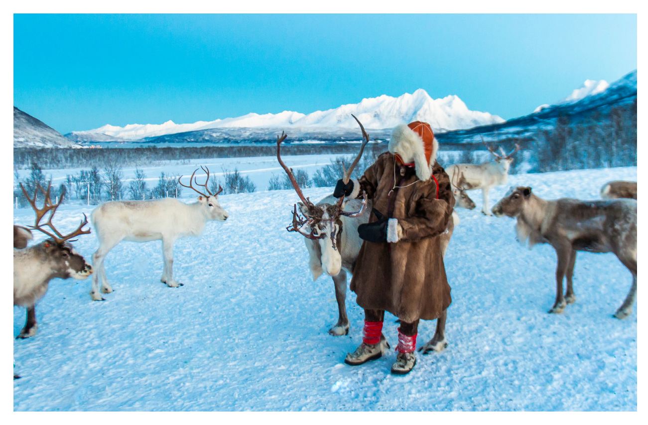
Saami reindeer herder dressed in traditional winter regalia.

have become more prominent and the geopolitical situation in the High North reflects heightened tensions between major powers globally.