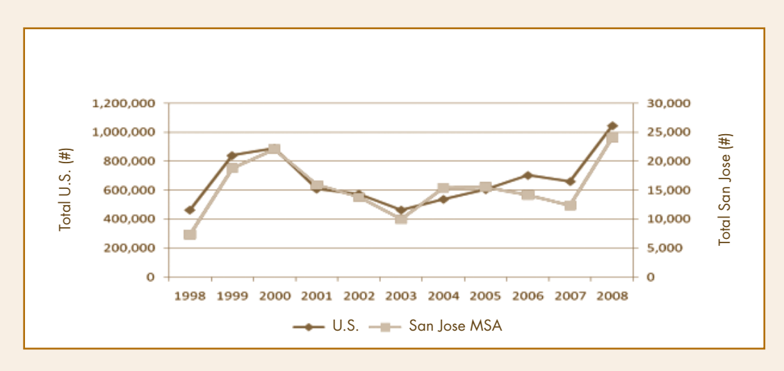
Chart 3. Persons naturalized, Total United States vs. San Jose-Sunnyvale-Santa Clara Metropolitan Statistical Area, FY1998-FY2008

Source: Department of Homeland Security, Office of Immigration Statistics, Annual Flow Reports